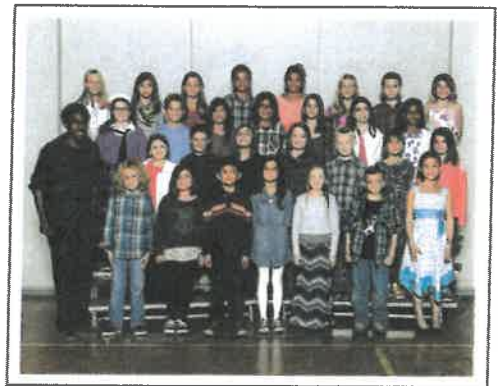
Design and class posing may vary by school.